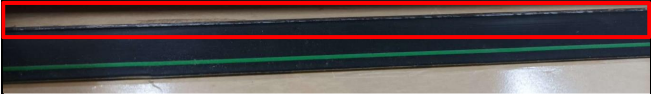
UNEVEN HEIGHT OF CUSHION CREASE AND CEASING BLADE NOTE: THIS BLADE IS A COMMON BLADE